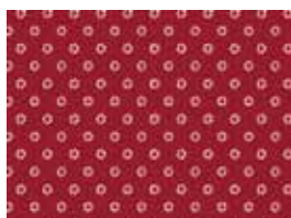
5062-R 2 yards