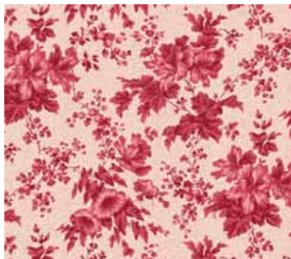
5059-R 3 yards