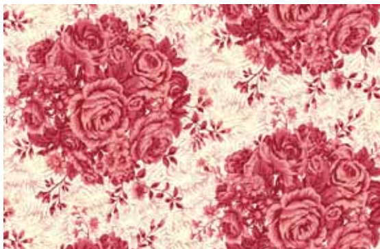
5058-R 1¼ yards