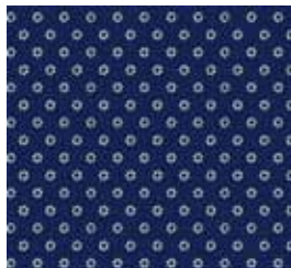
5062-B 2 yards