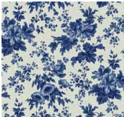
5059-B 3 yards