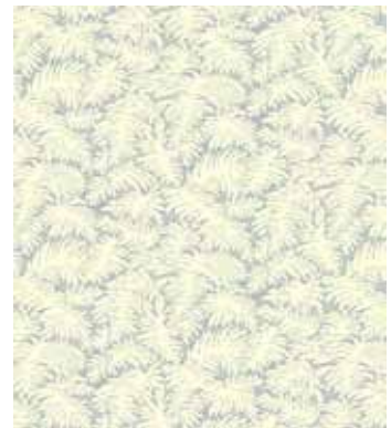
5060-B 2½ yards