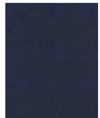
1867-B7 2½ yards (includes binding)