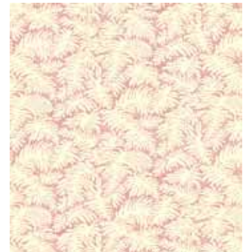
5060-R 2½ yards