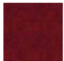
1867-R2 2½ yards (includes binding)