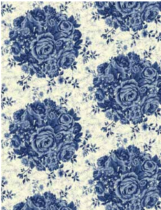
5058-B 1¼ yards

Fabrics shown are 20% of actual size. All fabrics used in the quilt patterns